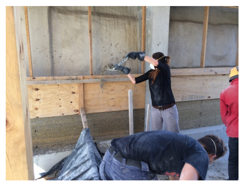
Caption: Hemp-crete building in action