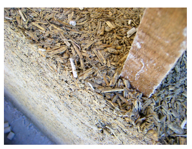
Caption: hemp-crete: hurd, lime, water and small amount of cement