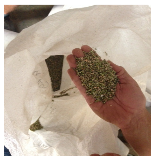
Caption: Seeds from Rapula Farm harvest