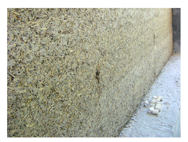
Caption: Hemp-crete layers drying