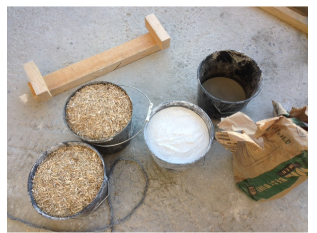
Caption: Hemp-crete mixture ratios