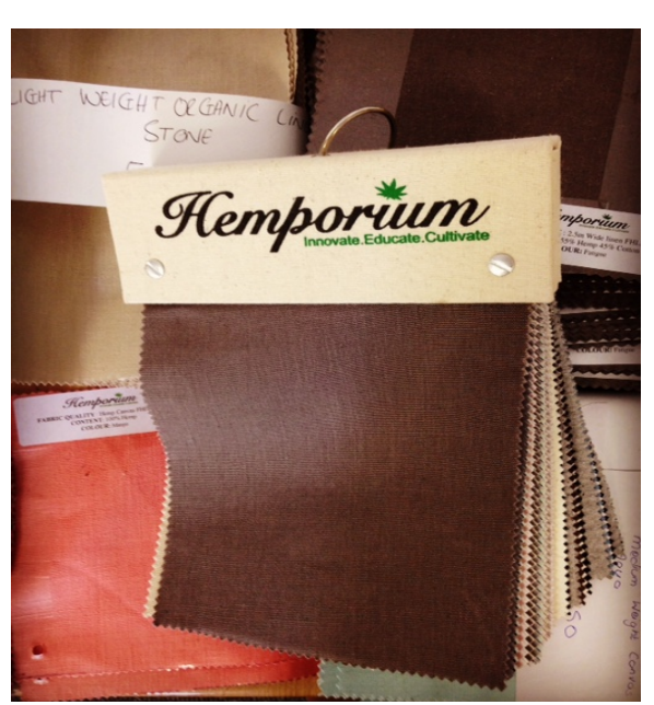
Caption: Hemp fabric