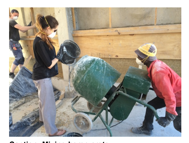
Caption: Mixing hemp-crete