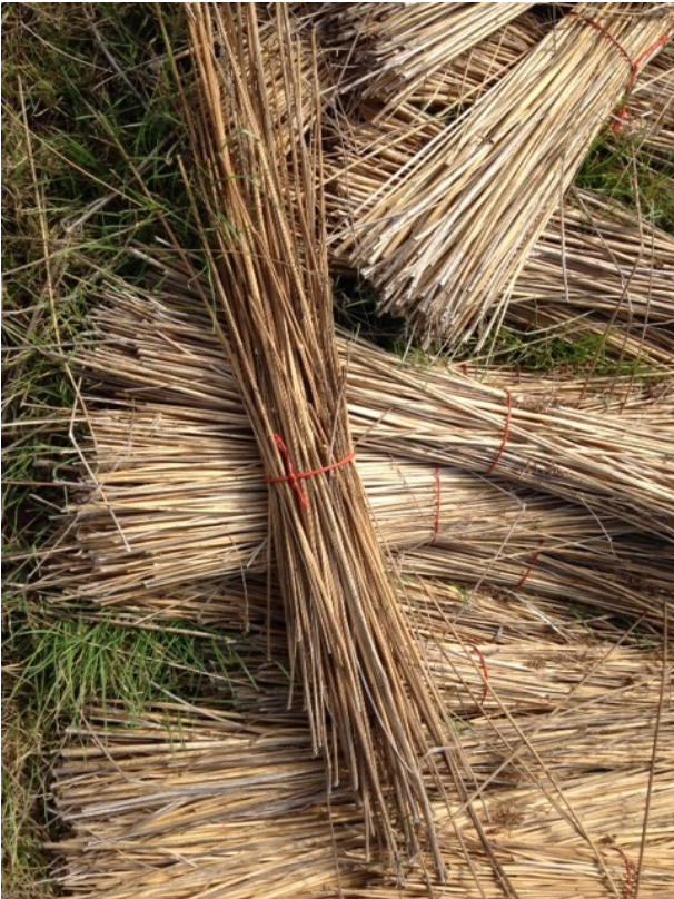
Caption: Retting hemp stalks and the final product